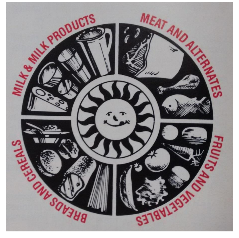
Figure 1. "Groups of foods" according to an informative leaflet - 1980s.

As it can be seen in Figure 1, meat and animal products occupy half the space of the food groups, which is revealing about the lobbies of livestock industries. It also helps to explain the enormous increase of meat and other animal products on the food habits developed through the course of the second half of the twentieth century (Weis 2016).