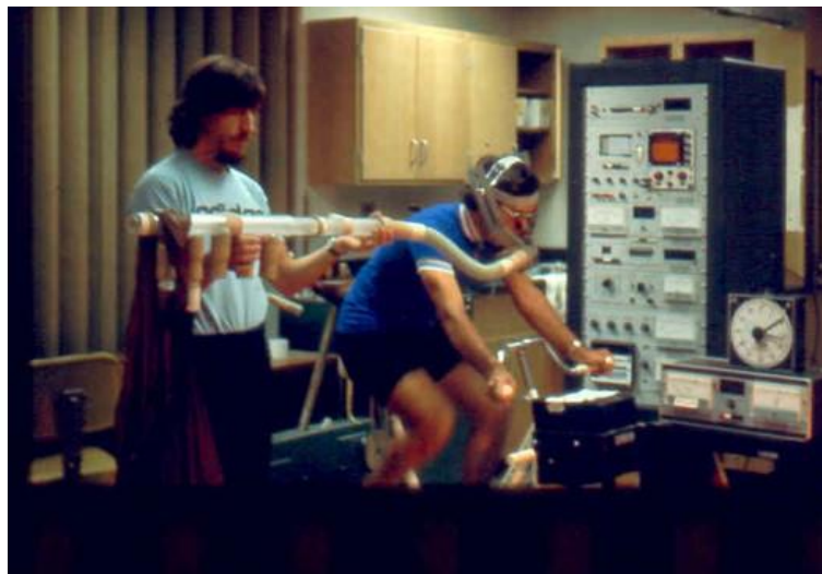
Figure 02. Lab Work 1974