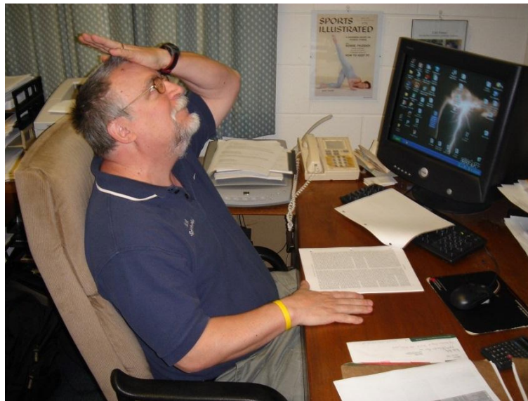
Figure 01. Typical posture when serendipity is acting

enough to see the solution, and often got more than they were looking for as a result. Serendipity has played a large role in science and technology, from the apple falling on Newton's head, to the discovery of plastic, to the discovery of penicillin, to the development of cardiac catheterization, even to the development of Viagra. Serendipity, this experience of getting more than you were expecting, is going to play a large role in my personal journey that parallels the rise of a profession called applied exercise physiology.