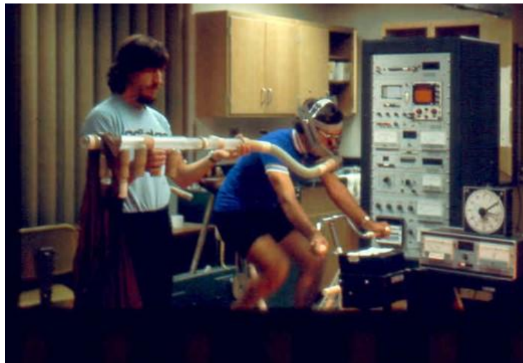
Figure 04. Pacing Research 2006