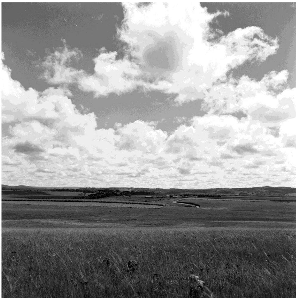
Figure 4: Dutch pioneer settlement on the grasslands of Paraná. The Castrolanda district.