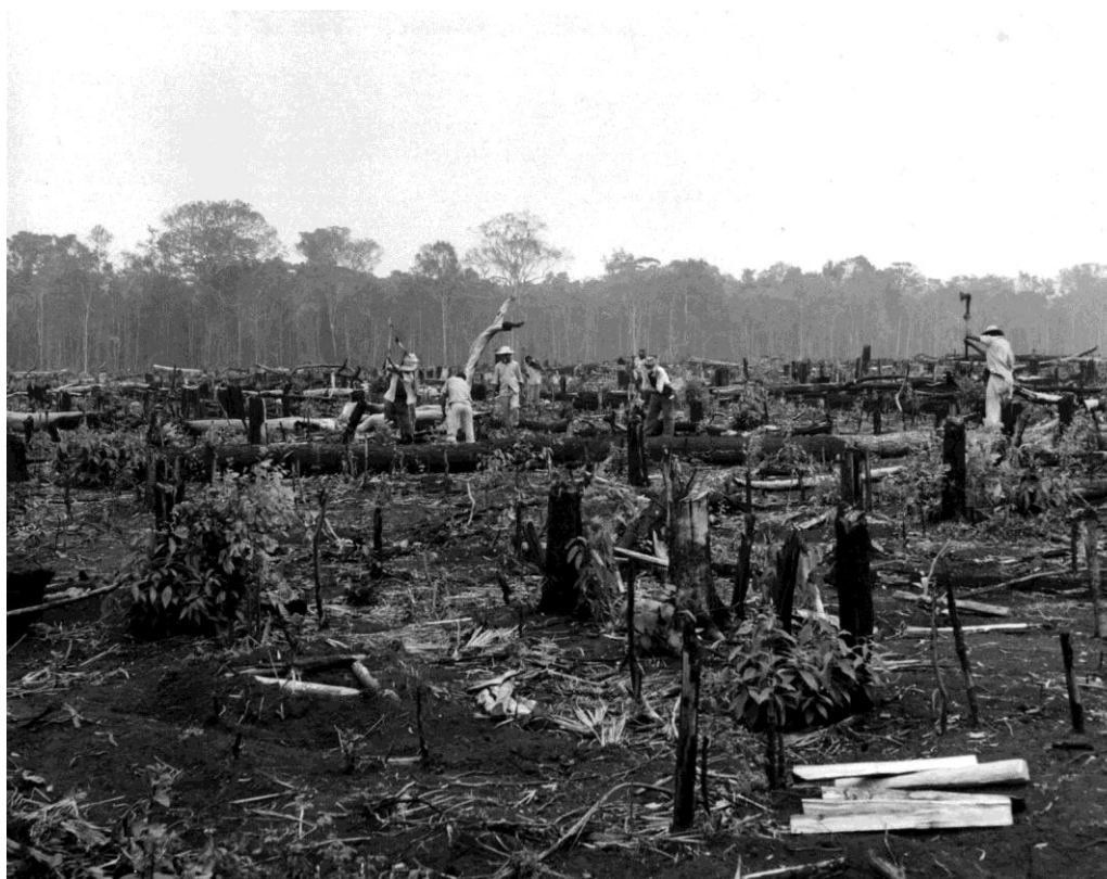
Figure 3: First planting of coffee on partly cleared land. Near Ceres, Goiás.