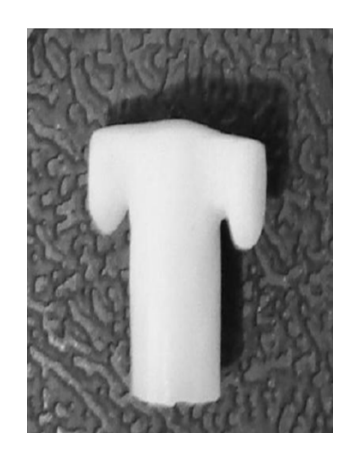
Figure 1 – Ceramic coping modified with two handles for testing tensile bond strength.

We used 50 solid pillars of 5.5° to 8° taper (Straumann No. 048541/ITI, Waldenburg, Switzerland). The analog/abutment assembly was torqued using a torque control device in a PVC pipe with a standardized torque force of 35 N. All instruments and implant components were obtained from the same company (Straumann Dental System, Waldenburg, Switzerland) and the study protocol was in accordance with the manufacturers' instructions.